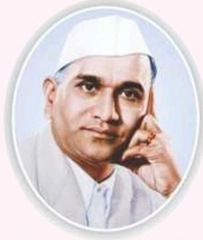
Karmaveer Bhausaheb Hiray