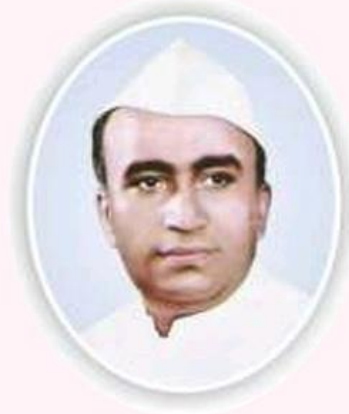
Loknete Vyankatrao Hiray