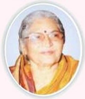
Hon'ble Smt. Pushpatai Hiray